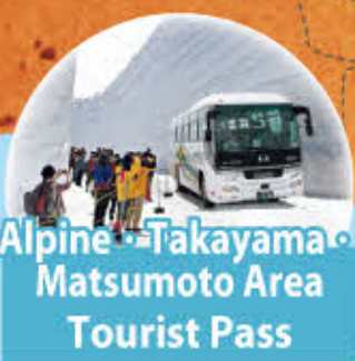
Alpine・Takayama・ Matsumoto Area Tourist Pass