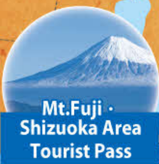
Mt.Fuji・ Shizuoka Area Tourist Pass