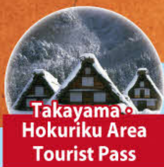
Takayama・ Hokuriku Area Tourist Pass